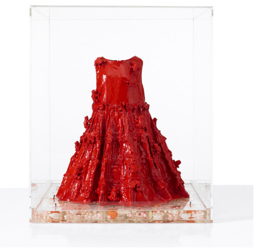
Cloned Frogs on Gala-dress. 56,5x46x46 cm.