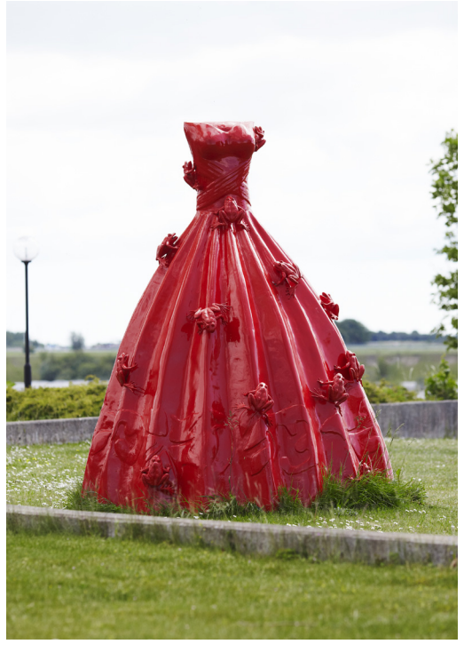
Cloned Frogs on Gala-dress, 240x190x190 cm.

Galleri GKM Siwert Bergström Stora Nygatan 30 SE-211 37 Malmö Sweden Phone +46 (0)40 611 99 11 Fax +46 (0)40 611 85 45 office@gkm.se http://www.gkm.se